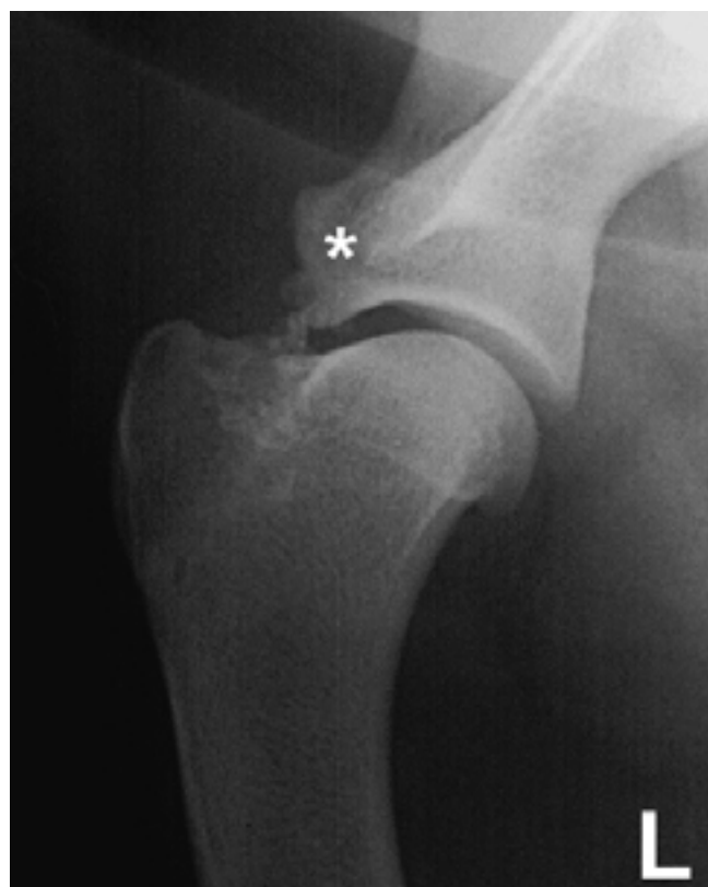
Figure 3: Mediolateral radiograph of the left shoulder joint 8 weeks after the first ESWT session, prior to the second session: the supraglenoid tuberosity (asterix) is smooth and regular, the mineralised structures along the intertubercular groove are unchanged in number and size, but appear more rounded and less active.

ESWT was repeated eight weeks after the first session. At this time, the dog had mild left forelimb lameness, localized to the shoulder joint that was considered grade 1 out of 4 in severity. Follow-up radiographs of both shoulder joints were obtained prior to treatment. The supraglenoid tuberosity was regular and smooth and the mineralised structures at the supraglenoid tuberosity and in the intertubercular groove appeared more rounded, smooth, and less active. However, the mineralization structures were unchanged in size and number (Fig. 3). A third ESWT session was performed after a subsequent eight weeks. Survey radiographs of both shoulder joints taken at this time revealed no further changes in the structure or density of the mineralised structures compared to the previous radiographs. An orthopaedic examination performed six months after the last ESWT revealed minimal lameness in the left forelimb that was only detectable following exercise. Minimal signs of pain were elicited on flexion of the shoulder joint and concurrent extension of the elbow, what pointed to a bicipital tendonitis. The dog was again anaesthetised and radiographs and CT of both shoulder joints were performed, demonstrating mild progression of enthesophyte formation and mild osteophyte formation on the caudal articular margins of the left joint. Findings in the right joint were unchanged.